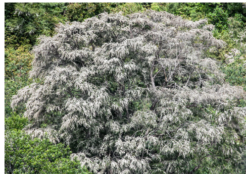
Mohaka River viaduct.

Coastal to lowland shrubland, regenerating forest and forest margins, also present in montane forest, ultramafic shrubland and very occasionally present in subalpine shrubland (up to 900 m a.s.l.).