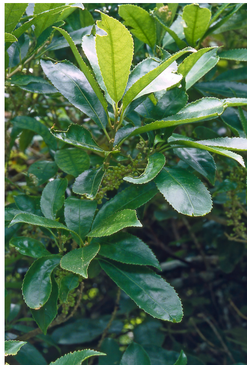
Otari Wilton's Bush, Wellington.