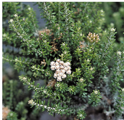
Pencarrow coast, Wellington Harbour.