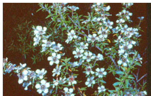
Taken in Coromandel, February.