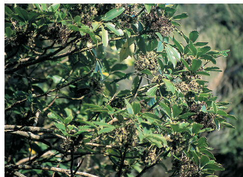
Stokes Valley, Lower Hutt.

Coastal to montane (10-750 m a.s.l.). Moist broadleaf forest. Frequently epiphytic. A frequent component of secondary forest. Streamsides and forest margins.