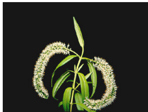
Rotorua, February.

Common in successional habitats from coastal areas to lower montane habitats.