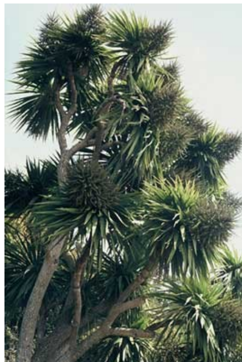
Cabbage tree.