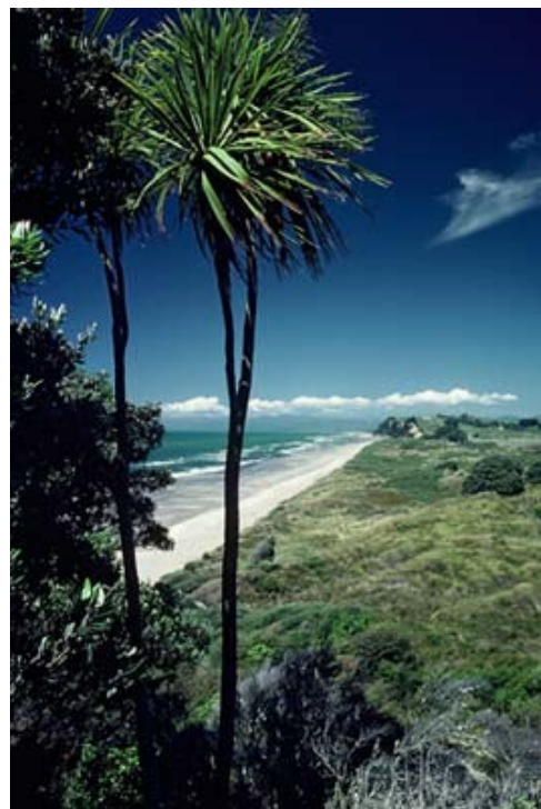
Cabbage tree.

Widespread and common from coastal to montane forest. Most commonly encountered on alluvial terraces within riparian forest.