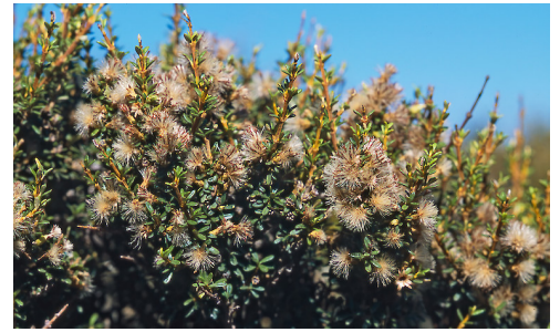
Turakirae Head.