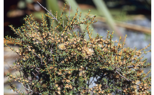
Turakirae Head.