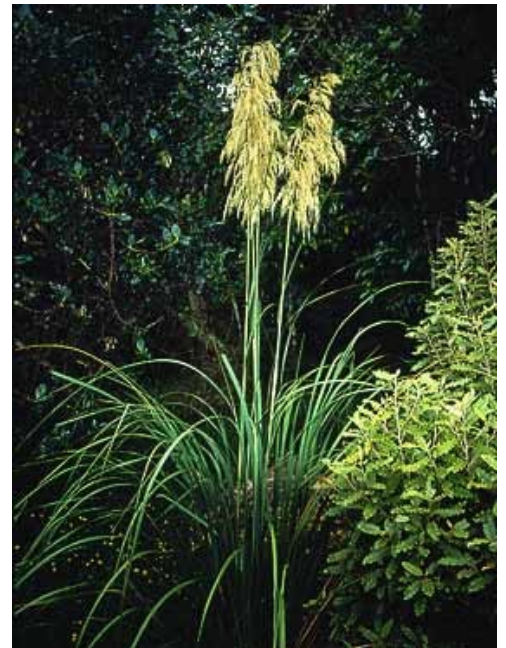
Toetoe.