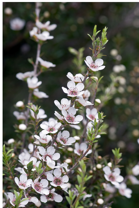
Southern Taranua Range.

Abundant from coastal situations to low alpine habitats.