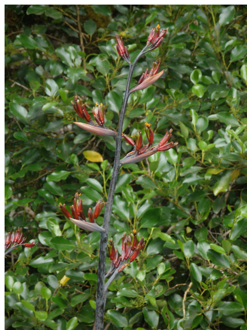
Routeburn, Fiordland.