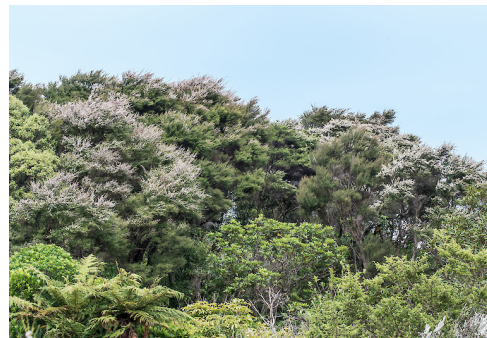
Stokes Valley, Lower Hutt.