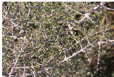
Eastbourne.