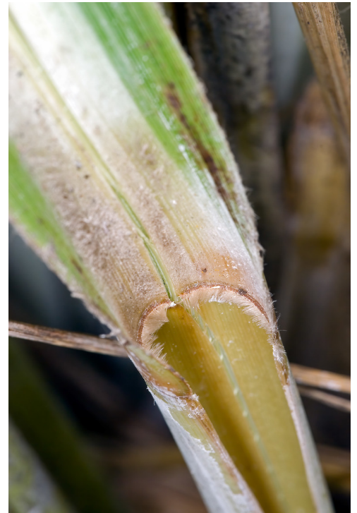
Ligule. Wainuiomata River mouth.

Common in freshwater swamps and wet places from sea level to lower montane habitats. Often growing in association with flax/harakeke ( Phormium tenax ).