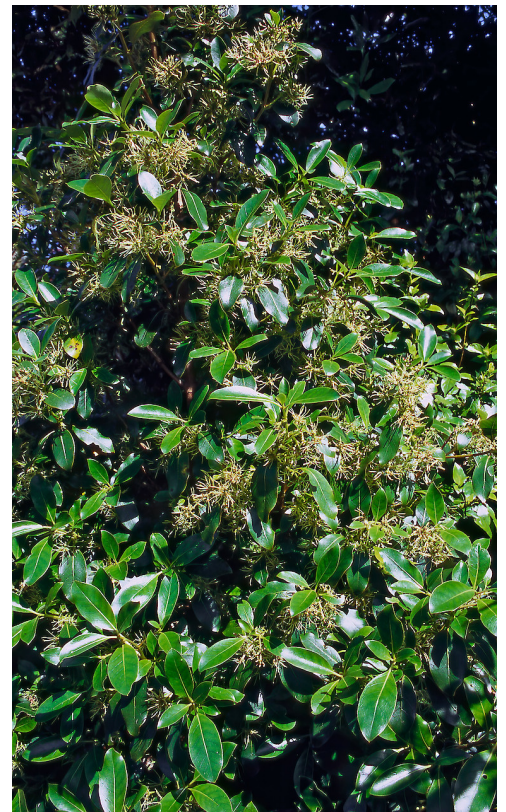
Pistillate flowers. Boulder Hill, western Hutt hills, Lower Hutt.