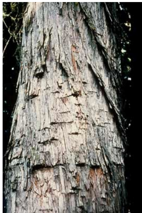
Totara bark.