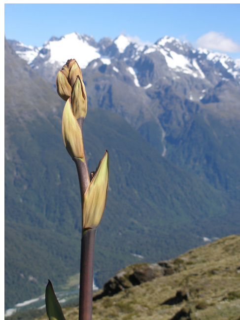
Hollyford Valley, Fiordland.

Strictly confined to subalpine, alpine situations.