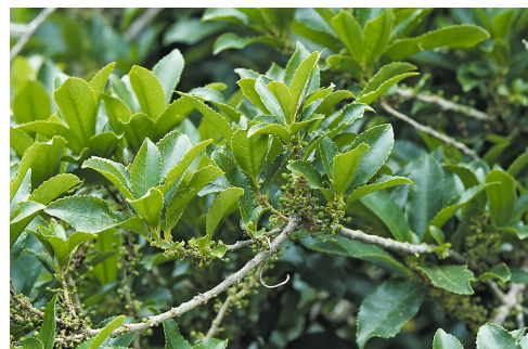
Otari Wilton's Bush, Wellington.

Abundant small tree of coastal, lowland, and lower montane forests throughout the country.