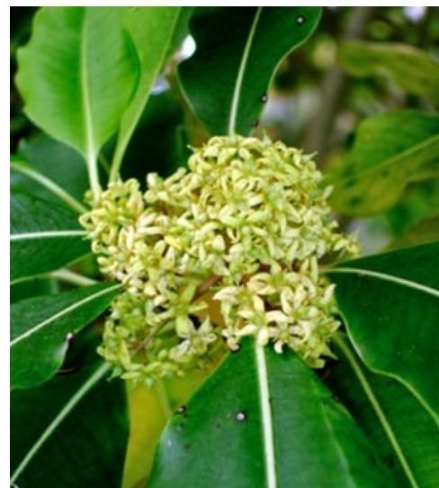
Female flowers. Oct 2006.

Common tree of regenerating and mature forest in coastal to montane situations.