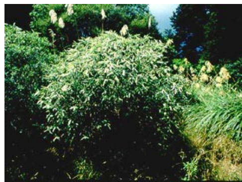
Rotorua, February.