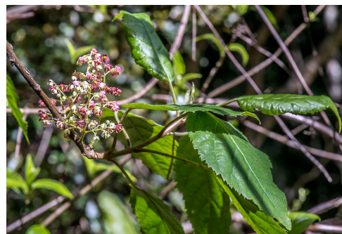
Stokes Valley, Lower Hutt.

Dioecious tree to c. 10 m tall; trunk and branches upright, to 30 cm diam.; bark smooth, grey, spotted with lenticels; branchlets light to dark red, pubescent. Leaves opposite to subopposite; petiole slender, to 50 mm long, greenish often flushed pink; midvein conspicuous above, raised below; secondary veins obvious and raised below giving surface a wrinkled uneven appearance; lamina membranous, 5-12 x 4-8 cm, glabrate (pubescence may persist on veins below), broad-ovate, margin deeply doubly and irregularly sharply serrate, tip acuminate, base cordate to truncate, upper surface light or dark green, undersides pale green, frequently infused with purple or pink. Juvenile leaves larger. Inflorescences conspicuous, axillary, flowers 4-6 mm diam., in panicles 6-10 cm long, on slender pubescent pedicels 5-10 mm long. Sepals 4, ovate, c. 3 mm long, pubescent, pink; petals 4, 3-lobed (often deeply), c. 9 mm long, white to light pink to red. Stamens many, on glandular minutely pubescent disc, not exceeding petals. Ovary 3-4-celled, styles 3-4. Fruit a c. 8-seeded fleshy depressed-obovoid berry, 5 x 4 mm, bright red to black. Seed irregularly angled, ventral surface flattened, circular or broadly elliptic, 1.9-3.1 mm, surface irregular, aril absent.