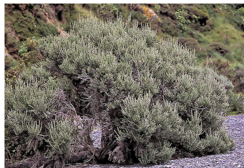
Pencarrow coast, Wellington Harbour.

https://www.nzpcn.org.nz/flora/species/ozothamnus-leptophyllus/