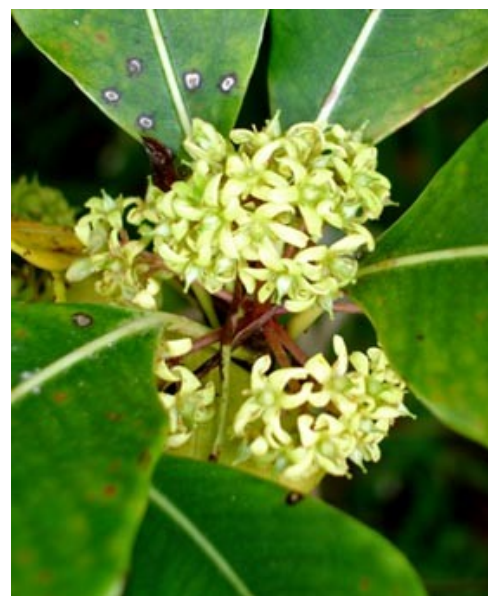
Female flowers. Oct 2006.