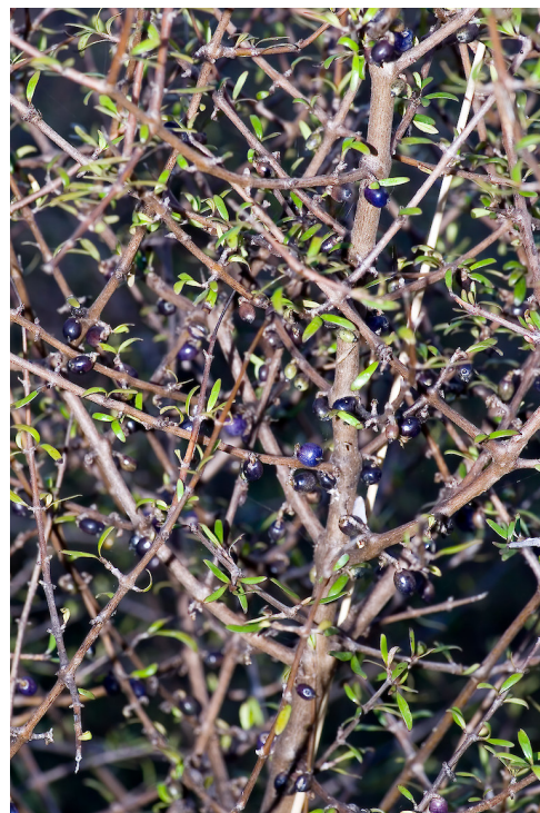
Pauatahanui Inlet.