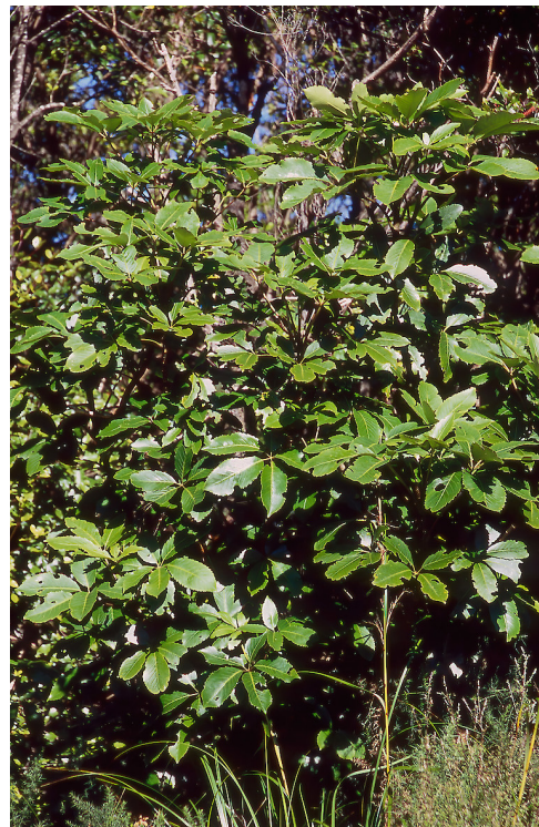
Stokes Valley, Lower Hutt.