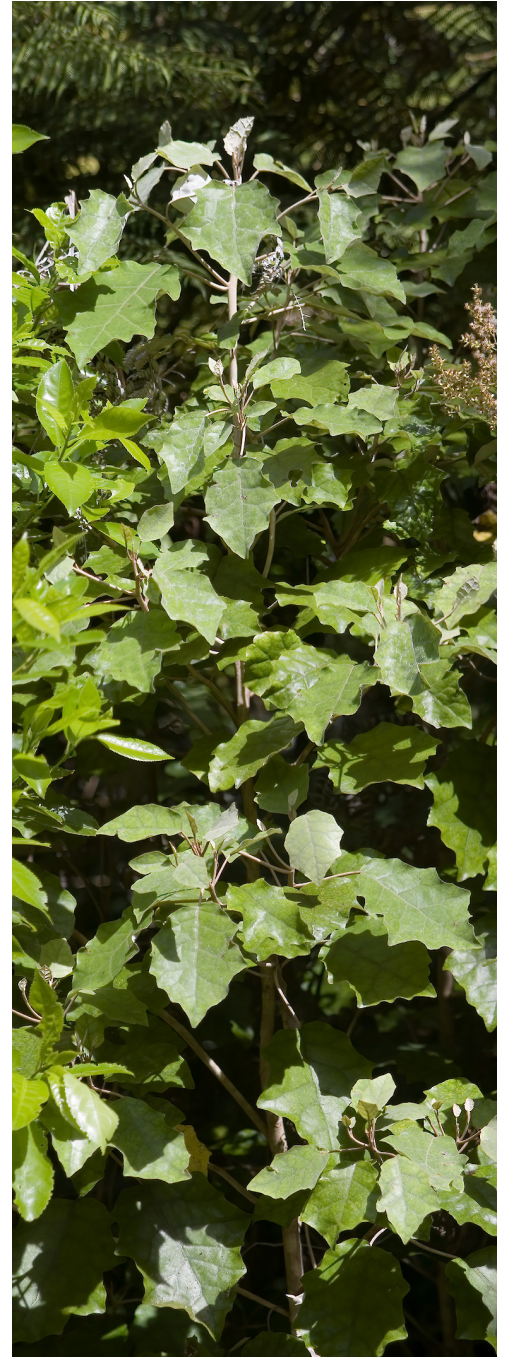
Stokes Valley, Lower Hutt.