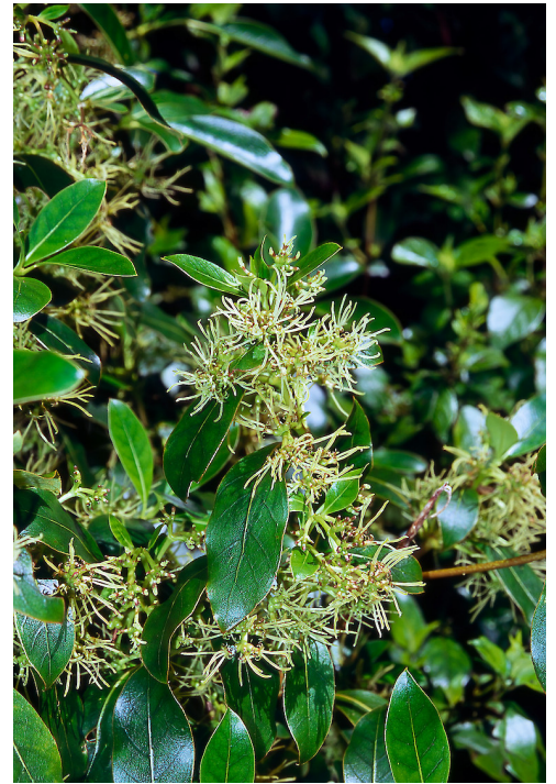
Pistillate flowers. Boulder Hill, western Hutt hills, Lower Hutt.

Common throughout coastal, lowland and lower montane habitats within shrublands and open sites within forest.