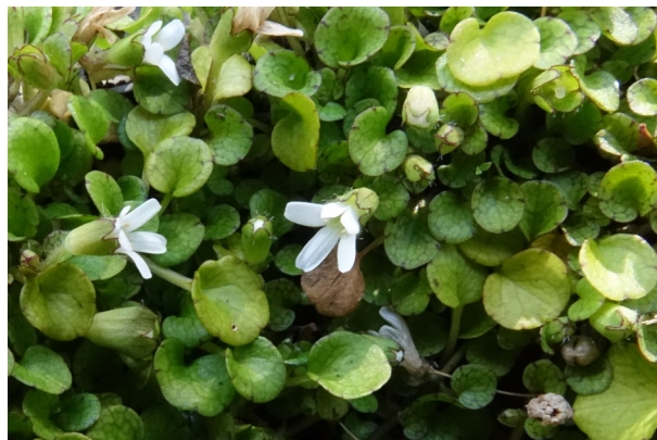
Figure 2. A flowering plant of Ourisia modesta collected and cultivated from the Catlins 30 November 2021.

The First Clearing is located c. 400 m north-east (downstream) of Tautuku Hut. This clearing is c. 4 ha in size consisting of c. 3 ha of shrubland surrounding 0.85 ha of red tussockland. The vegetation present includes: red tussockland, marsh, mixed shrubland and mānuka shrubland. The mixed shrubland on the fringe of the red tussockland was of particular interest being dominated by Olearia laxiflora , Coprosma dumosa , C. decurva , C. rigida , mountain tauhinu and inaka, with an understory of prickly shield fern and red tussock. The ground cover includes a rich diversity of herbs including the rare Ourisia modesta (Fig. 2.), Tetrachondra hamiltonii , Myosotis tenericaulis and Ranunculus ternatifolius .