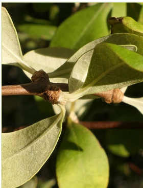
Olearia hectorii .