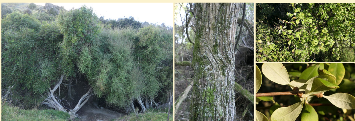
Olearia hectorii , Chalk Range, Marlborough, 29 April 2022. (left) Growth habit; (centre) bark; (top right) foliage; (bottom right) foliage detail.

Olearia hectorii is a small, deciduous, twiggy tree that grows up to 10 metres tall, with pale furrowed bark. Leaves are reasonably small and grey-green on the upper surface, with silvery tomentum on the undersides. The capitula (flower clusters) are on slender, silky pedicels and consist of pale yellow florets. The achenes (seeds) are small and wind-dispersed.