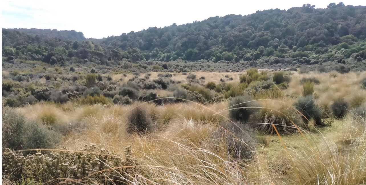
Figure 3. Second clearing Tautuku Valley.

The Second Clearing (Fig 3.) is the largest of the clearings (c. 11.72 ha) and is located c. 250 m north of the First Clearing. It consists of red tussockland and grassland (c. 3.08 ha) and mixed shrubland (8.64 ha). The vegetation present includes: red tussock – exotic grassland, tall red tussockland, Olearia bullata shrubland, Olearia lineata shrubland, mixed forest and mānuka forest. The Olearia lineata shrubland was of particular interest, being dense and diverse with emergent Olearia lineata up to c. 6m tall. The commonly associated shrubs are weeping māpou, Coprosma decurva , C. dumosa , C. rigida , C. pseudociliata , Olearia laxiflora and Meliccytus flexuosus . The ground cover has little hard fern, Poa imbecilla , Hydrocotyle heteromeria , H. novae-zeelandiae , Ranunculus membranifolius , R. ternatifolius , R. foliosus , Tetrachondra hamiltonii , Galium propinquum and Myosotis tenericaulis .