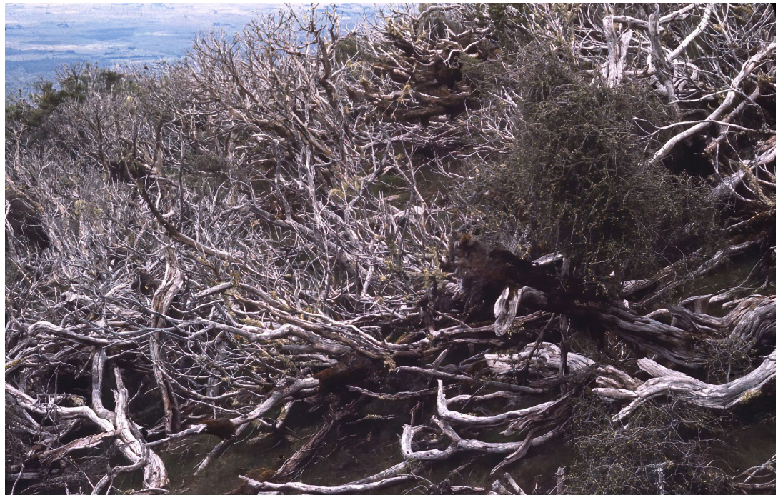
Figure 1. Dead Brachyglottis elaeagnifolia above Mangahume Hut, Egmont National Park 7 January 1965.