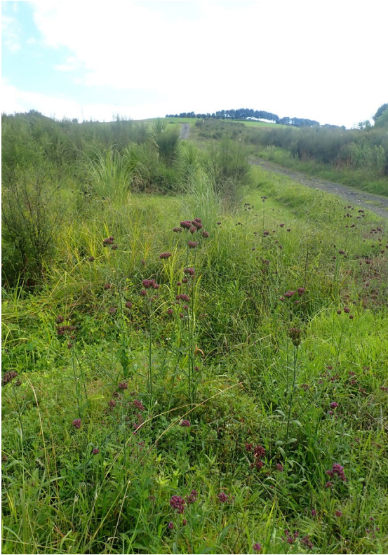
Figure 3. Weedy habit of Verbena incompta . Photo: Marley Ford, 2020.

Verbena incompta is the name best suited to the weedy, widely spread purple top of New Zealand (Ford 2022). Since the revision, true V. bonariensis has been found throughout Auckland and on the Chatham Islands but still remains the less common of the pair.