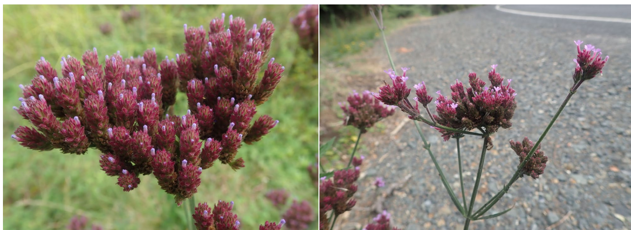
Figure 1 (left). Flower spikelet of Verbena incompta .

Verbena incompta is a more robust plant than the rarer V. bonariensis , and these species can be easily separated. V. incompta has elongated flower spikes (Figure 1) and V. bonariensis has a broader corolla (Figure 2). The species epithet of Verbena incompta refers to the untidy nature of this plant and the untidy places it often inhabits (Michael 1995). It is a widespread weed in the North Island and the northern South Island, often seen on disused land (Figure 3).