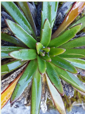
Pachycladon fasciarium .