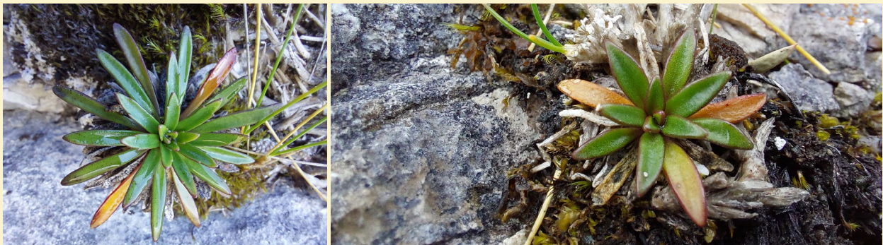
Pachycladon fasciarium , Chalk Range, 28 April 2022.

Pachycladon fasciarium is most similar in appearance to P. fastigiatum which can be found in the same catchment. P. fasciarium differs by having glabrous, and usually entire, leaves, unlike those of P. fastigiatum which are toothed and sometimes hairy. Although P. fastigiatum is found in the area, it is not found in the specific habitat of P. fasciarium .