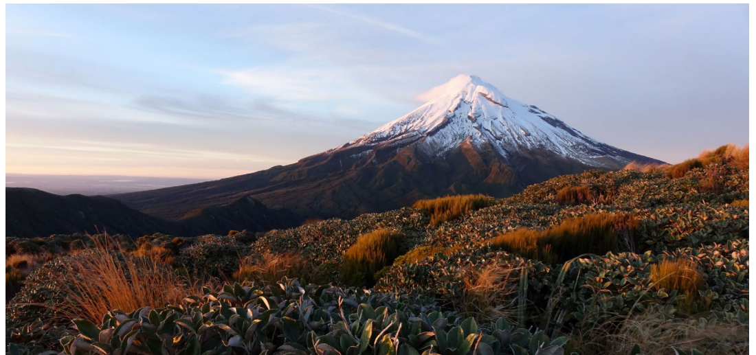
Figure 1. Taranaki Mounga from Pouakai Range.

It's also pleasing to hear that the Taranaki Mounga Project https://taranakimounga.nz/ is working towards significantly reducing other pest animals and plants on the mountain. A great example of what can be achieved when we work together towards a common objective.