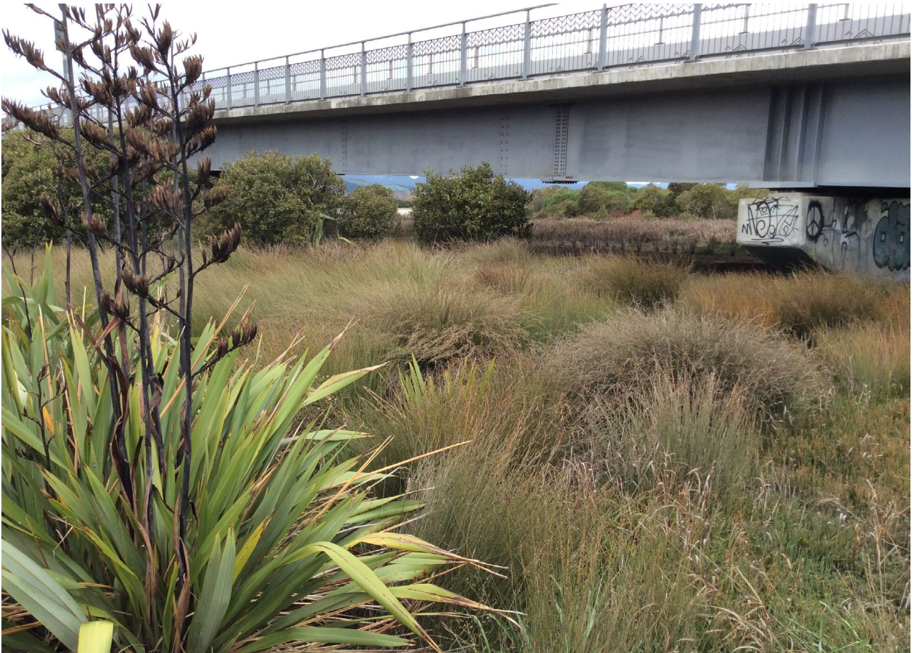
New (2011) Kopu Bridge over Waihou River. Makaka and three species of rush added to the few manawa remaining after removal of construction machinery.

From 2016 a smaller group, Kopu Bridge Wetlands Care Group, has focused on intensively planting and maintaining an area of about 1 hectare. We decided on this use of our limited human resource after seeing the success of planting three different rushes at 750 mm spacing. Meg Graeme had noted a lack of sea rush ( Juncus kraussii var. australiensis ) and oioi ( Apodasmia similis ) communities in 2006 (Graeme, M. 2006). As well as these two species, Machaerina juncea was trialled. It has matured and has a sparser, shorter growth habit, allowing sea meadow plants to grow amongst the rhizomes. Our planted clusters of makaka/saltmarsh ribbonwood have added seedlings to those of the original occasional bushes that grew throughout the site. Pōhuehue and ngaio are also self-seeding now.