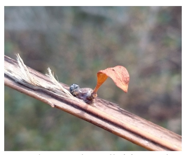
Fig. 3: Single remaining dessicated leaf of green mistletoe seedling. Photo: John Barkla, 8 September 2021.

It's well known that germinating seeds of Ileostylus can produce their first set of leaves prior to making haustorial contact with their host (Smart 1952). The germinating seed did not appear to have physically penetrated its host and the leaves it produced were presumably nourished solely by the endosperm. At this early stage of development, the mistletoe was effectively independent of its host.