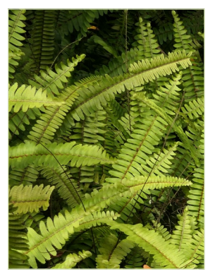
Nephrolepis flexuosa.