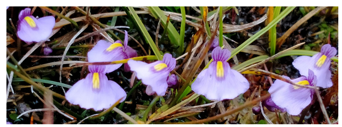
Utricularia dichotoma subsp. novae-zelandiae, Mount Kyeburn December 2021.

Lower down, in a comb sedge ( Oreobolus pectinatus )-dominated bog at 1200 m asl, we encountered loads of purple-flowering bladderworts ( Utricularia dichotoma subsp. novae-zelandiae ), Celmisia alpina , sundew ( Drosera arcturi ) and Bulbinella angustifolia .