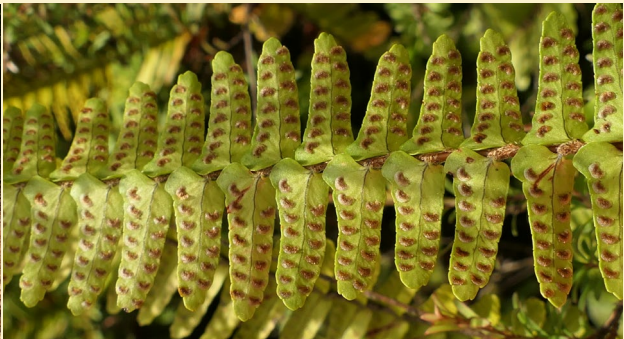
Nephrolepis flexuosa , Rainbow Mountain, Waiotapu 17 December 2021: (left) growth habit; (right) underside of frond showing sori arrangement.

Plants are generally bright green and sward-forming and are often found in dense clusters up to one metre tall. The fronds are erect and each have between 50–80 pairs of deltoid-oblong pinnae. The fertile pinnae are distinctively shorter, have crenulate margins and have round sori evenly distributed on their undersides.