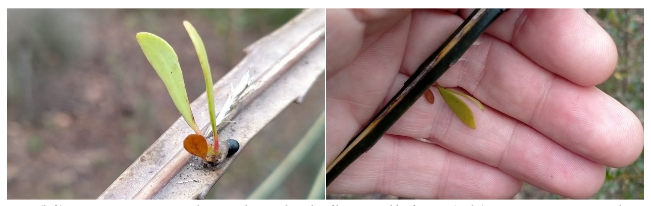
Fig. 1 (left): Germinating green mistletoe seed on underside of lancewood leaf. Fig. 2 (right): Germinating green mistletoe seed showing top surface of lancewood leaf. Photos: John Barkla, 17 July 2021.

The next day, 17 July 2021, I visited the church grounds and soon located the lancewood. It was c. 3 m tall, with juvenile leaves. About 1.6 m from the ground, on the underside of one of the leaves, I found a mistletoe seed well adhered between the central leaf vein and the edge of the leaf. Three mistletoe leaves (the largest c. 1.5 cm) protruded from the seed (Fig.1 and Fig. 2).