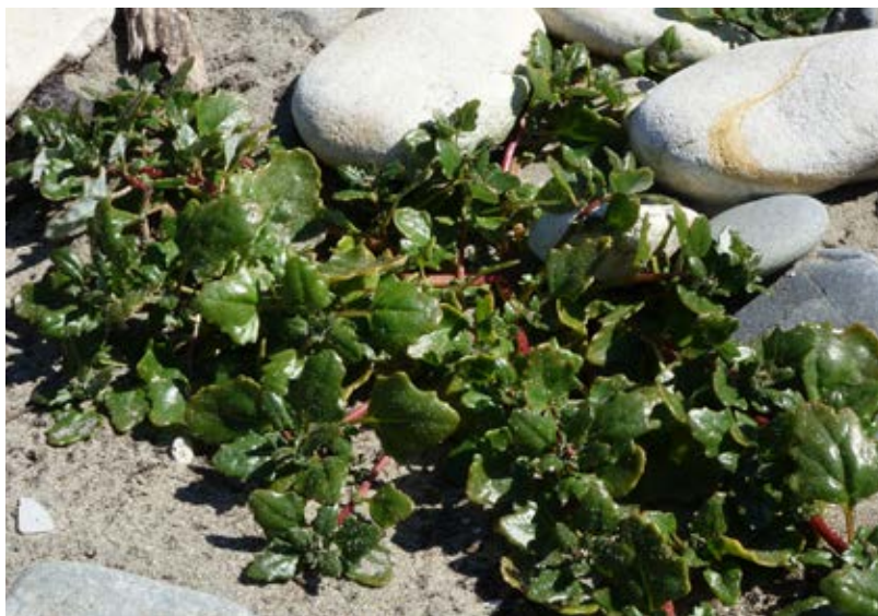
Fig. 1. Oxybasis ambigua —here seen growing on sand at Little Hellfire, Rakiura (Stewart Island).