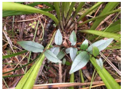
Metrosideros parkinsonii seedling.