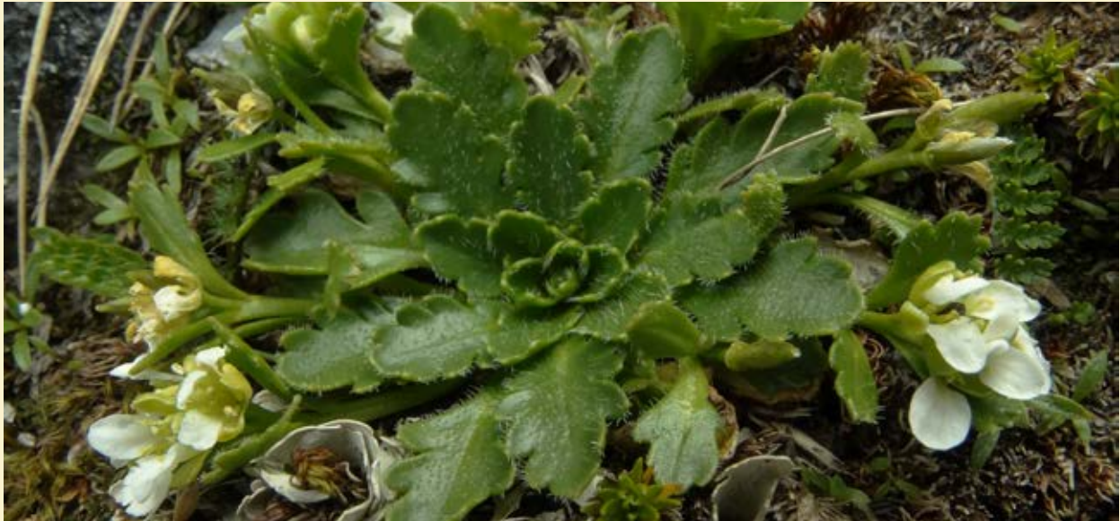
Pachycladon crenatum .

The plant of the month for June is the Fiordland Pachycladon , Pachycladon crenatum , one of 10 Pachycladon species endemic to the New Zealand region. Like most of the other mainland New Zealand species, P. crenatum is found in alpine habitats. This species can be seen in the mid to high alpine areas of Fiordland National Park, possibly spreading eastwards into the Takitimu mountains. Plants are found in cracks in rock slabs and open stony areas where there is little competition from other species. It is a small stature perennial plant, forming squat single rosettes, with a ring of short flowering stems emerging from beneath the rosette leaves. The flowers are comparatively large and white, with the fruits often turning orange.