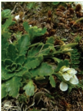
Pachycladon crenatum .