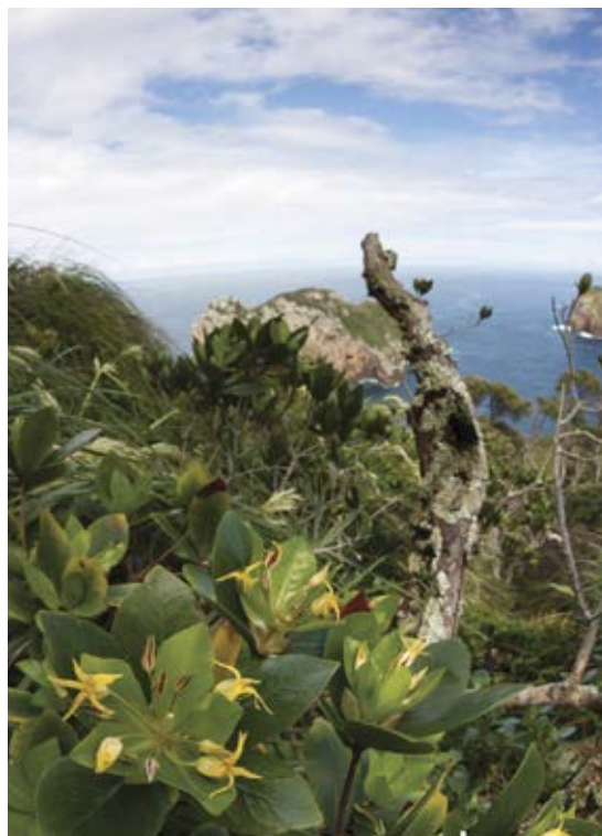
Male Pittosporum roimata on Tatua Peak, Aorangi Island, Poor Knights Islands.

In a recent paper (Carter et al., 2018) a new species of Pittosporum , Pittosporum roimata , is described. It is the only vascular plant endemic to the Poor Knights Islands. This new species has previously been referred to as a distinct yellow-flowered variant of Pittosporum cornifolium (tawhiri karo, wharewhareatua), a morphologically similar epiphytic shrub known from both main islands of New Zealand as well as other offshore islands. The new species is separated from P. cornifolium based on morphology, DNA sequence variation, as well as distribution. Pittosporum roimata is distinguished from P. cornifolium by flowers with yellow petals, larger inflorescences and in producing several terminal fruits per stem. Herbarium specimens of P. roimata statistically have larger leaves and shorter petioles than specimens of P. cornifolium . Pittosporum roimata is locally common on the Poor Knights, growing on rocky substrates associated with Xeronema callistemon (raupo taranga) and Metrosideros excelsa (pohutukawa). Using the current New Zealand Threat Classification System, the authors suggest a preliminary classification of this new species as 'at risk/naturally uncommon' qualified data poor [DP], one location [OL].