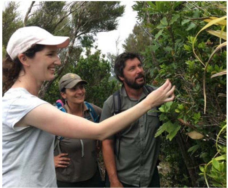
DOC and ABG staff on Great Barrier Island/Aotea.

one place and recognising that we could contribute to the Global Tree Seed Bank Project. The canopy of the Aotea comprises Myrtaceae species with kānuka ( Kunzea robusta ) and pohutukawa ( Metrosideros excelsa ) being the dominant elements of the landscape. It also has an endemic kānuka ( Kunzea sinclairii ) and populations of Parkinson's rātā ( Metrosideros parkinsonii ), which has a weird distribution including Aotea, Hauturu-o-Toi (Little Barrier Island) and northwest Nelson, and nowhere else in between.