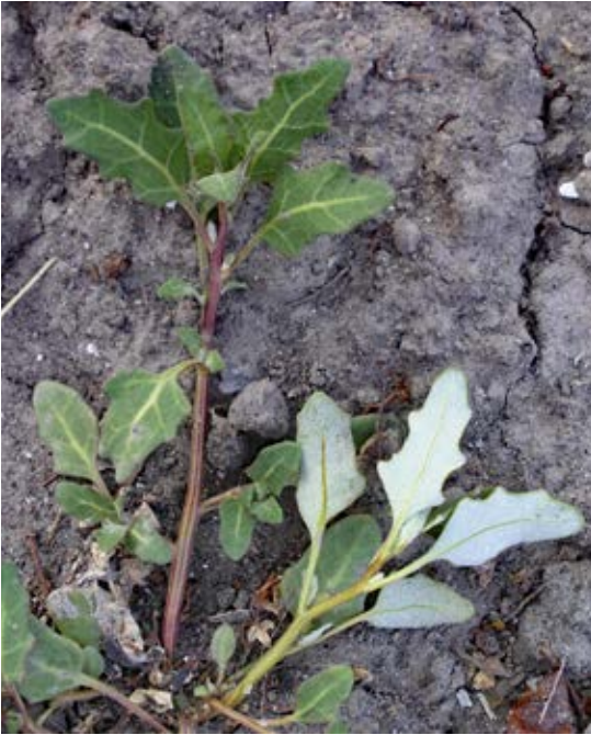
Fig. 2. Oxybasis glauca —a Northern Hemisphere species not currently confirmed in New Zealand. This plant was photographed as a weed in a garden in the Ukraine, Kiev Region, at Hrebinky.

of Oxybasis glauca and then, in 2013, as a subspecies— O. glauca subsp. ambigua (Mosyakin 2013). When that combination was made, Mosyakin (2013) was unaware of the differences in ploidy between Oxybasis glauca and his new combination within it, the Australasian / Easter Island subsp. ambigua .