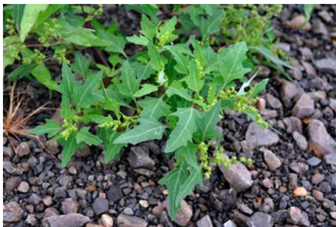
Fig. 3. Oxybasis amurensis – a Northern Hemisphere species allied to Oxybasis glauca. This plant was photographed in the Russian Far East, Khabarovsk Province, left bank of Amur opposite Nizhnetambovskoe Village. [In Russian: Хабаровский край, левый берег Амура напротив села Нижнетамбовское]

Evidently, more work has to be done to solve the problem of the geographic and evolutionary origins of our native Oxybasis . No doubt there will still be disagreement over our taxonomic decisions at the global level but, for now at least, the species rank allotted to the Australian – New Zealand – Easter Island Oxybasis ambigua makes the best use of available cytological, morphological and phylogenetic information. We hope that this decision accords some nomenclatural stability for those interested in its conservation status in the New Zealand part of its range.