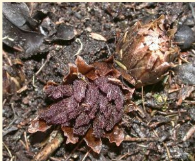
e.g., Dactylanthus taylorii .

Parasite: an organism that derives its food from the living body of another.