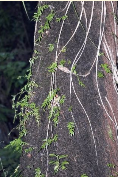
e.g., Tmesipteris lanceolata

Epiphyte: a plant that perches on another plant without harming it.