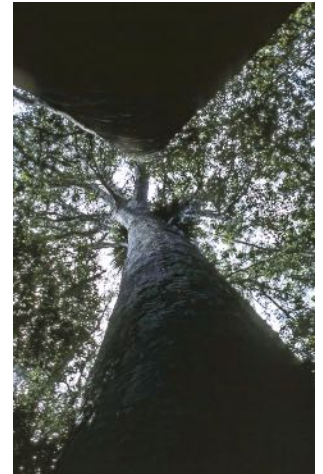
Kauri ( Agathis australis ).