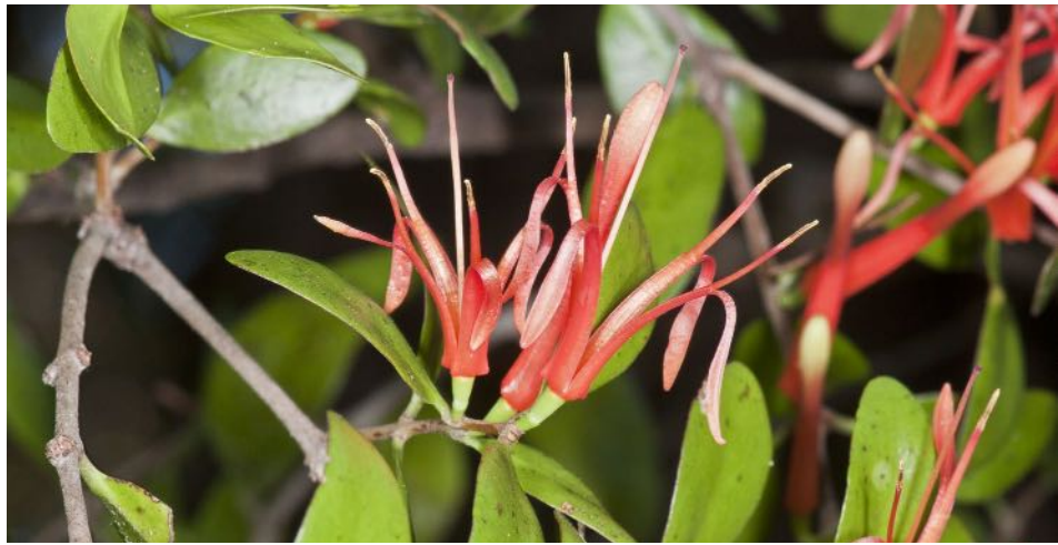
Peraxilla tetrapetala , red mistletoe.

Sometimes plants grow on each other as epiphytes (perching plants) (see box below). In other cases they take nutrients from their host. This select group of plants that depend on their host plants for nutrition is called parasites. Some parasitic plants also photosynthesise themselves—these are called hemi-parasites. In New Zealand several species of hemi-parasitic plant (such as the red and scarlet mistletoe— Peraxilla tetrapetala and Peraxilla colensoi ) are under threat from forest clearance and browsing by possums and, as a result, are becoming increasingly rare. One species of mistletoe—Adams's mistletoe ( Trilepidea adamsii )—that used to occur near Auckland is already extinct.