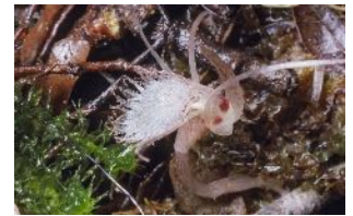
Corybas cryptanthus , a saprophytic orchid.

Plants that feed off dead rotting vegetation are known as saprophytes. Examples include thismia ( Thismia rodwayi ) and the cryptic orchid, Molloybas cryptanthus .