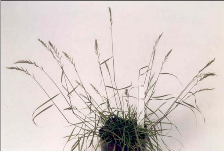
Figure 5. Dichelachne lautumia.