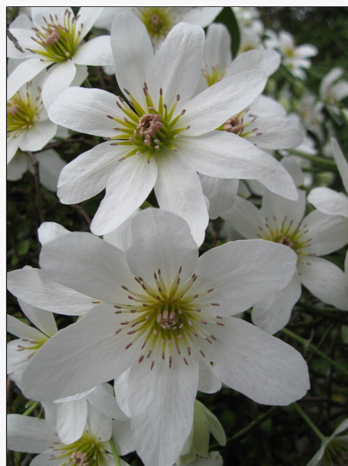
Caption: Dunedin Town belt