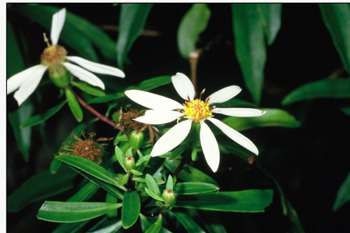
Caption: Brachyglottis kirkii var. kirkii

http://nzpcn.org.nz/flora_details.asp?ID=119